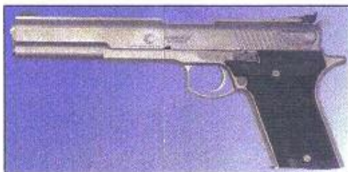
Automag III (.30 Carbine) 6 1/2" Barrel, 43 oz., 8 Round Capacity, Stainless Steel