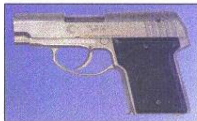
Backup Available in .45 ACP, 9MM, .40 S&W, .357 Sig., .400 Corbon, 23 oz., 5 Shots (6 for 9MM), 3" Barrel, 5.75" H x 1" W, Stainless Steel