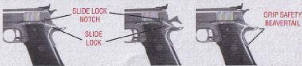
FIGURE 1. SLIDE LOCK NOTCH

The slide lock safety, Figure 1, can only be engaged when the slide is fully forward and the hammer is fully cocked. The slide lock safety prevents rearward motion of the slide and engages the sear to prevent forward hammer movement when the trigger is squeezed. The grip safety, figure 2, is automatically engaged to prevent rearward trigger motion until the pistol grip is firmly and properly grasped.