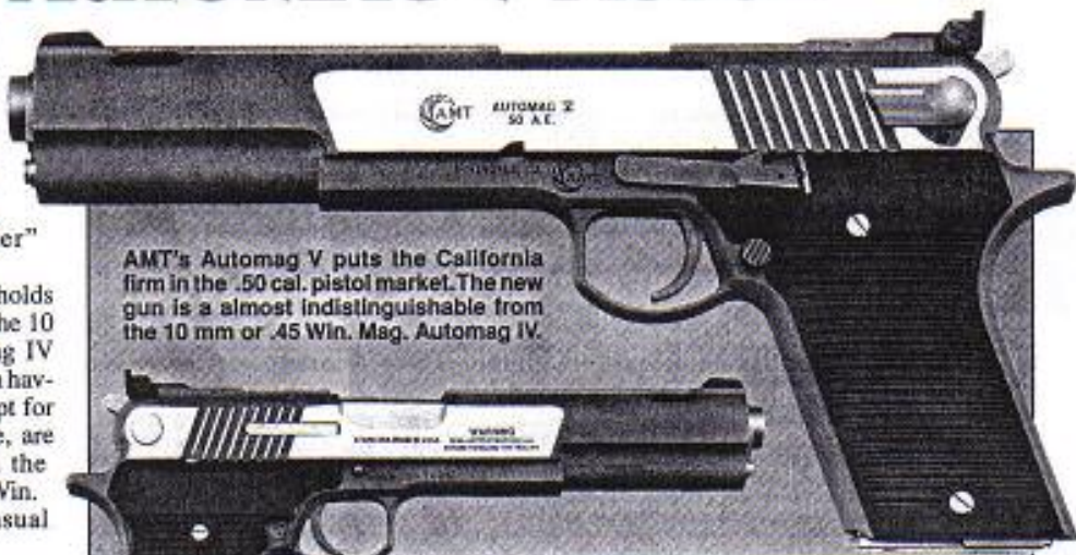
AMT's Automag V puts the California firm in the .50 cal. pistol market. The new gun is almost indistinguishable from the 10 mm or .45 Win. Mag. Automag IV.

Like its predecessor, the Automag V combines features from a variety of design sources. Its Government Model-style barrel bushing snugs up against an outward tapering barrel section. A full-length recoil spring guide plug is employed rather than the recoil spring plug familiar to M1911 owners.