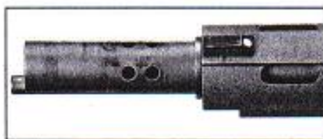
Holes in the barrel line up with ports in the Automag V's slide to allow gas to escape before the bullet exits the barrel. This system proved effective in reducing felt recoil.